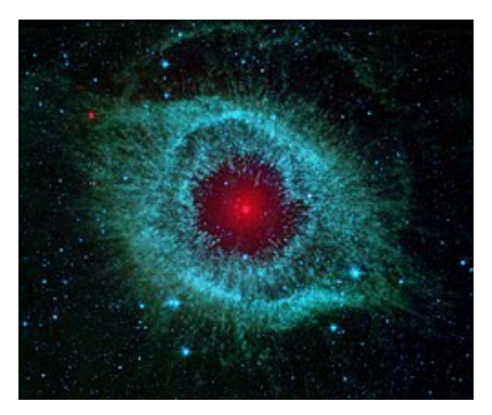
Drumalis, 24-29 June 2019

Within the Universe, the planet EARTH with all its wonder is the place for the Meeting of the Divine and the Human