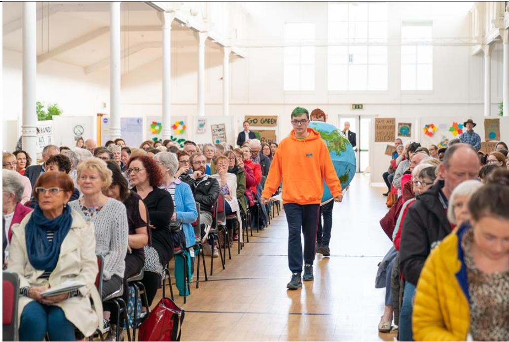
VAKS (Volunteers At Knock Shrine) carrying a sick globe on a stretcher process through the assembly for the opening ceremony heralding what the day was about.