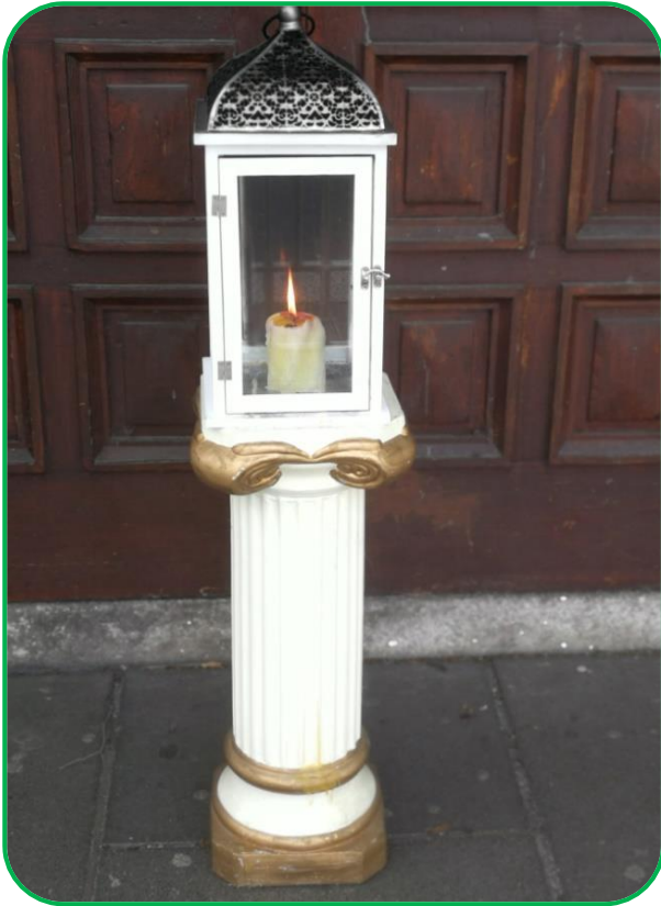
The Parish of Sean McDermott Street