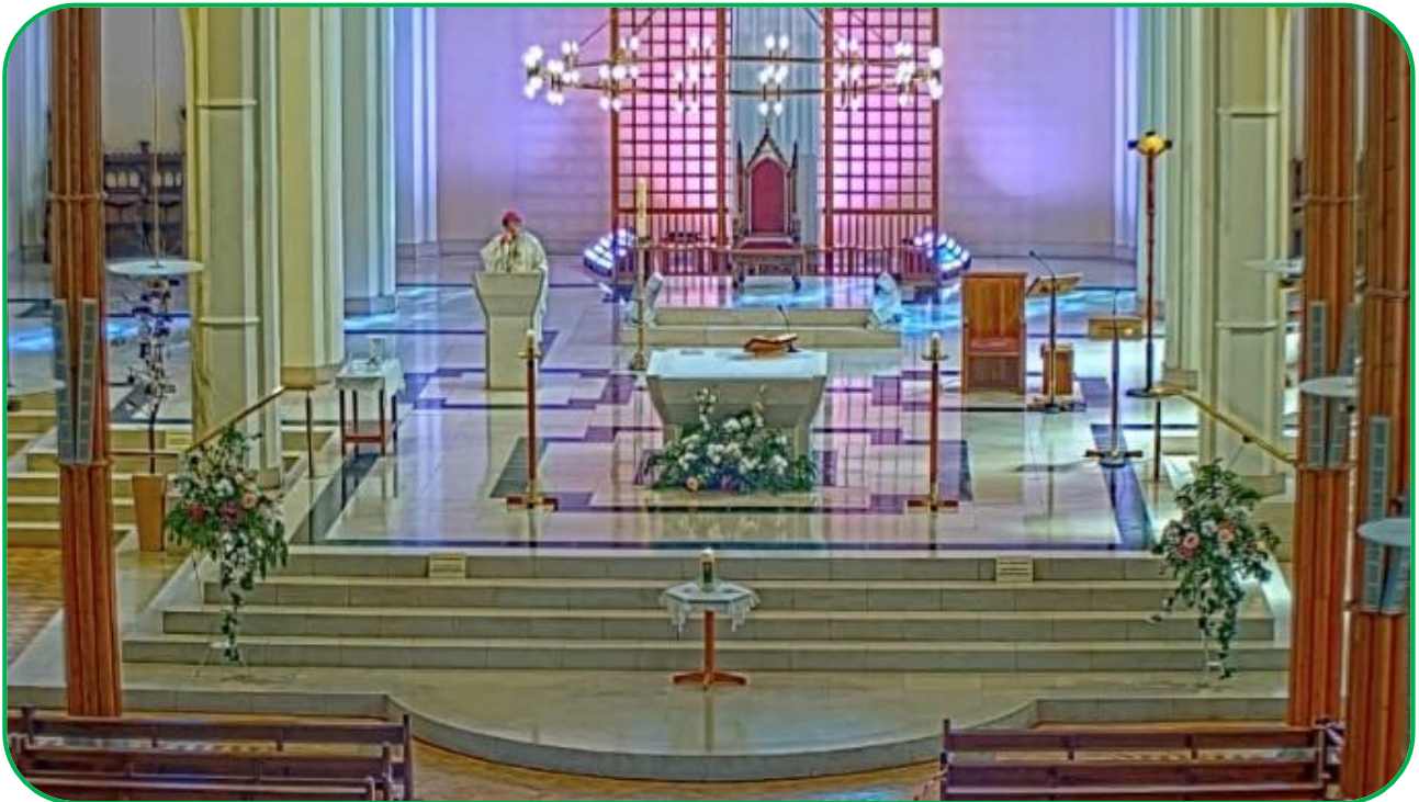
The Cathedral of St Mary & St Anne, Cork