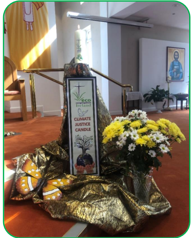
St Joseph's Parish, Bonnybrook