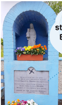
Shrine to St Brigid at Mountrice Cross, erected in 1982 by Lackagh Memorial Committee

"Authentic Tradition states that near this place Brigid, Mary of the Gael was born."