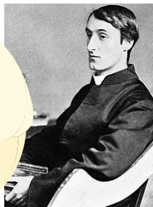
Gerard Manley Hopkins, leading Victorian poet