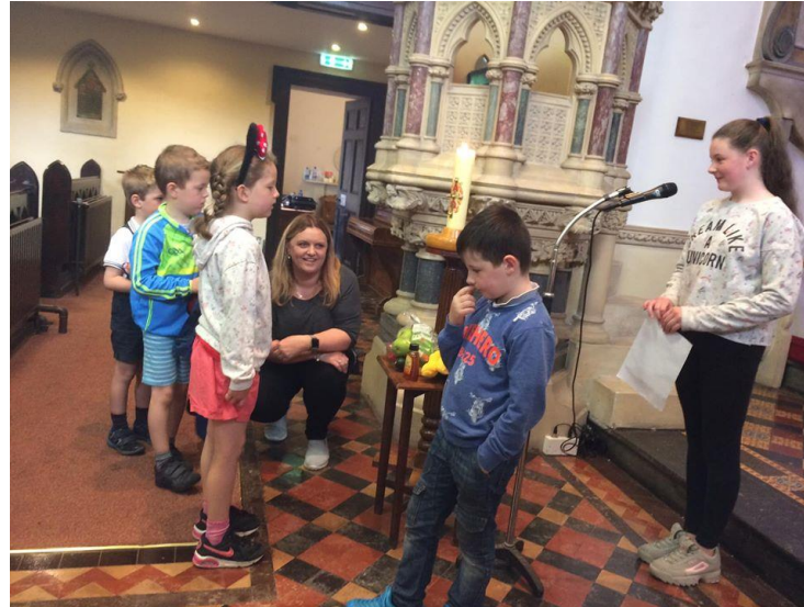
Leading the prayers in church on World Bee Day in May 2019