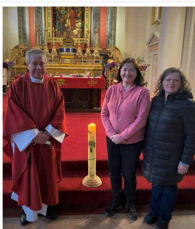
St Francis Xavier Church, Gardiner Street Parish, Dublin