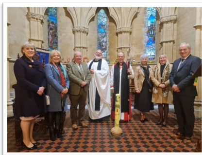
Donagh Group of Parishes