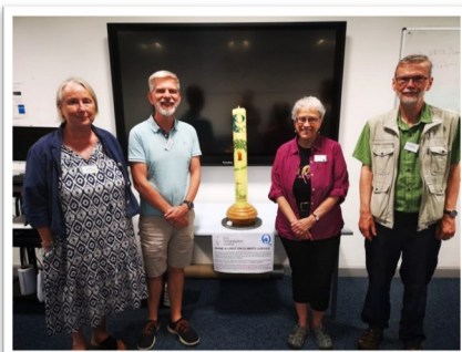
Ireland Yearly Meeting of Religious Society of Friends, Belfast