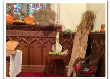
Christ Church, Delgany