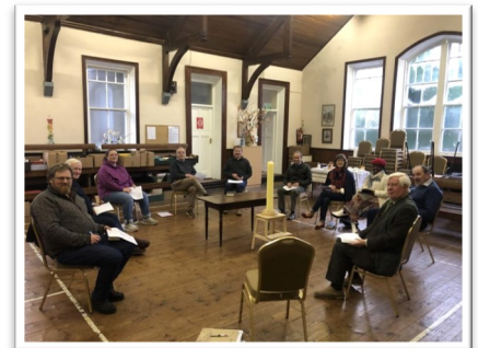
Methodist Church, Cloughjordan and Methodist Local Preachers Meeting