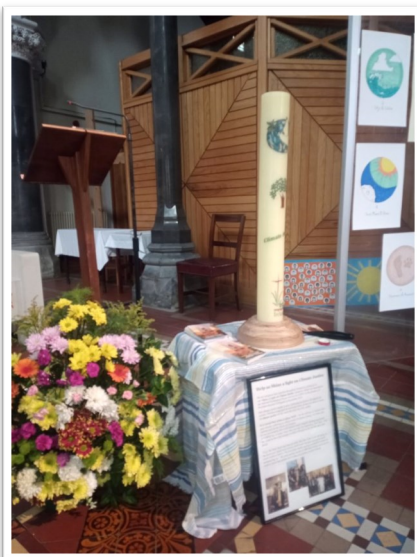
Church of The Immaculate Conception, Kanturk, Co Cork