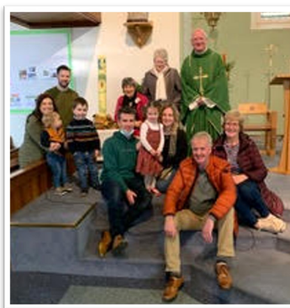
St Patrick's Church, Culfeightrin Parish, North Antrim