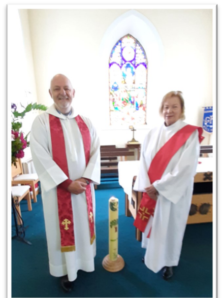
St Kieran's, Cloughjordan