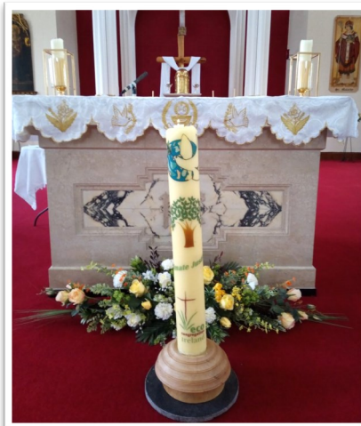
St Malachy's, Coleraine