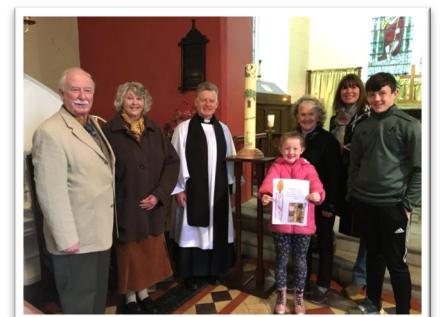
Bunclody Union of Parishes, Co Wexford