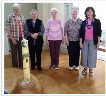
Mercy International Association 3 visits