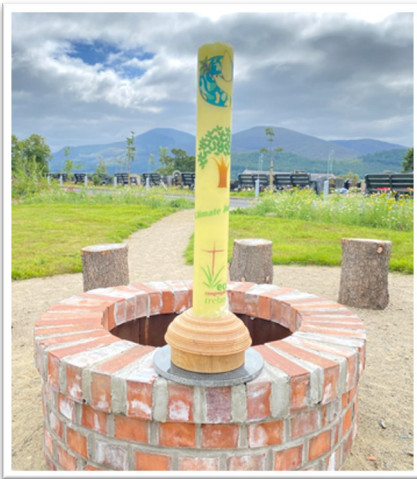
Bryansford Sacred Garden Official Opening, Co Down