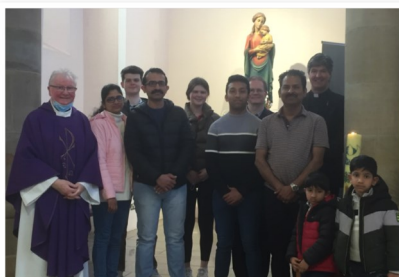
St Michael's Church, Enniskillen