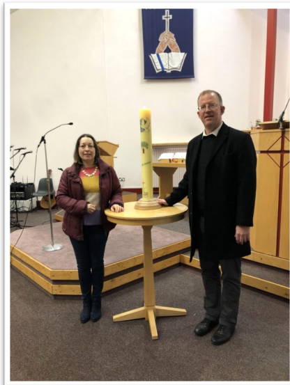
Cork Methodist Church