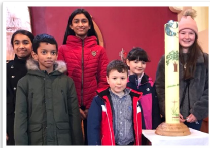
Togher Parish, Co Louth

The four Eco-Congregation Ireland Climate Justice Candles covering each of the four provinces of Ireland, have been weaving their ecumenical and climate justice journeys around Ireland in 2022. After a break due to the pandemic, the physical Climate Justice Candles started their journey again and proved to be a popular focus for worship amongst Christians of all traditions and a resource for awareness-raising of climate change and its impact on our world. Inspirational stories of churches that hosted the Climate Justice Candles in 2022, in many different and creative ways include: