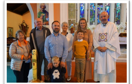
St Michael & St John Church, Cloughjordan