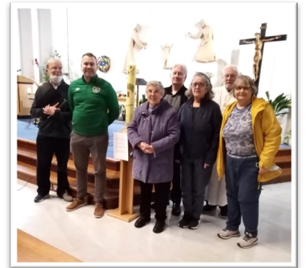
Holy Family Parish, Kill of the Grange