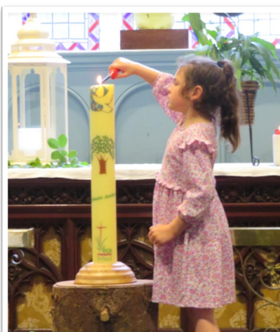
Tullamore Union, Church of Ireland Parishes

The following also hosted the ECI Climate Justice Candle in 2022: