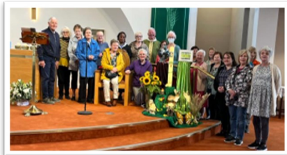
St Joseph's Bonnybrook