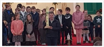
St Anne's Parish, Shankill