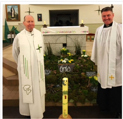
Ecumenical St Brigid's Day Service in Kildare