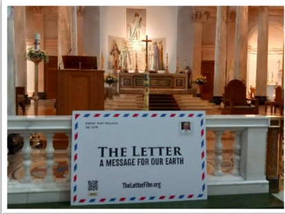
Saints Patrick & Felim Cathedral, Cavan