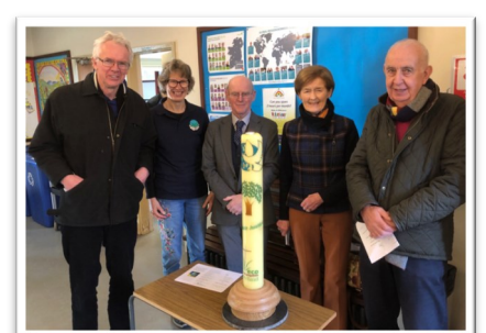
Knock Presbyterian Church, Belfast