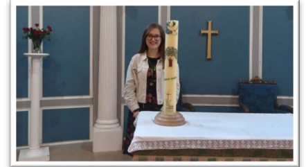
Wexford & Kilsoran Union of Parishes