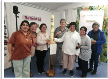
The Congregation of Dominican Sisters, Cabra