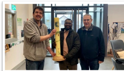
Carrigrohane Union of Parishes