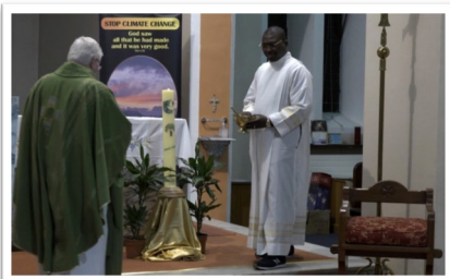
African Missions SMA, Blackrock Road, Cork