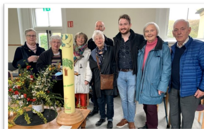
Churchtown Quaker Meeting, Dublin