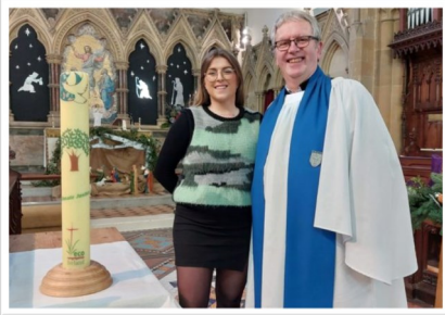
Christ Church, Bray

The four Eco-Congregation Ireland Climate Justice Candles covering each of the four provinces of Ireland, have continued weaving their ecumenical and climate justice journeys around Ireland in 2023. The candles proved to be a popular focus for worship amongst Christians of all traditions and a resource for awareness-raising of climate change and its impact on our world. Inspirational stories of churches that hosted the Climate Justice Candles in 2023, in many different and creative ways include: