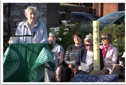
Wilton Justice Group, Co Cork