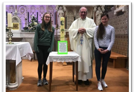
Parish of Listowel