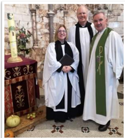
Holy Trinity Westport, St Thomas Dugort Achill, Christ Church Castlebar and Turlough Church