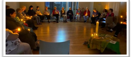
St Pappin's Parish, Ballymun