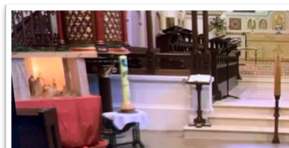
St George's Church, Belfast