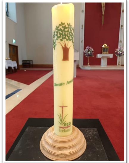
Church of St Therese, Mount Merrion