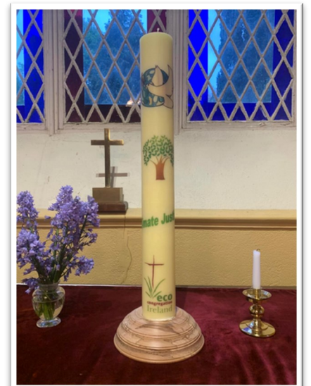
All Saint's Church Ballycarney, Ferns Union of Parishes