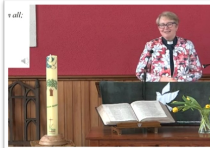
Gorey Methodist Church