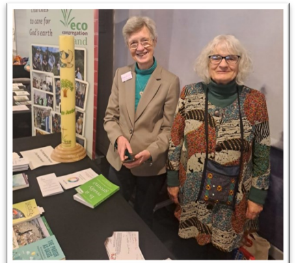
Parishes Caring for Creation Conference in the Crowne Plaza Hotel, Blanchardstown