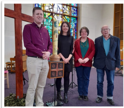
Lowe Presbyterian Church, Belfast