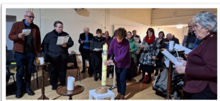
Solas, the Walk of Light, Dublin