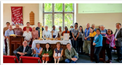
Methodist Centenary Church, Dublin