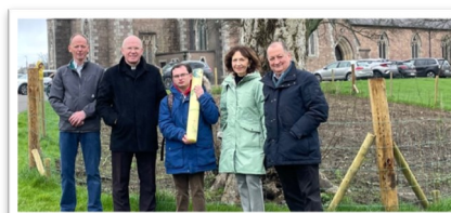
Bride Street Church, Wexford