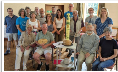
NI Creation Care Network, Belfast